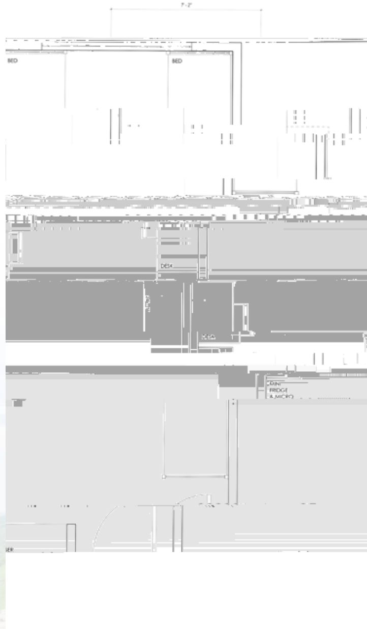
3 Person Room